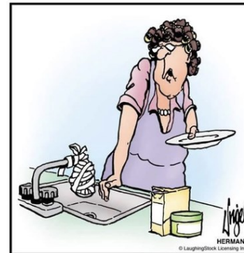
"I see you've fixed the drip!"

Tues 3rd - Mandurah Cruise Thur 5th - WA Ballet Thur 12th - Garrick Theatre - The Lion, The Witch & The Wardrobe Mon 16th - Classic Book Club Wed 18th - Home Movie